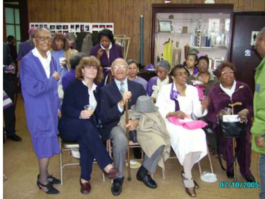
Women's Day fellowship after worship service