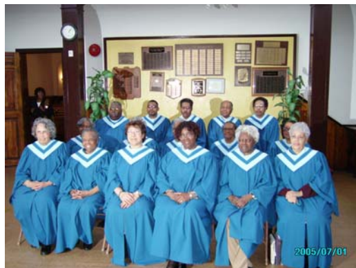
Senior Choir prepares for Ecumenical Choir Festival at Our Lady of Blessed Sacrament Catholic Church