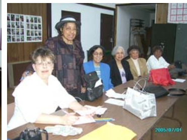
Flower Club at work on Easter Lily project